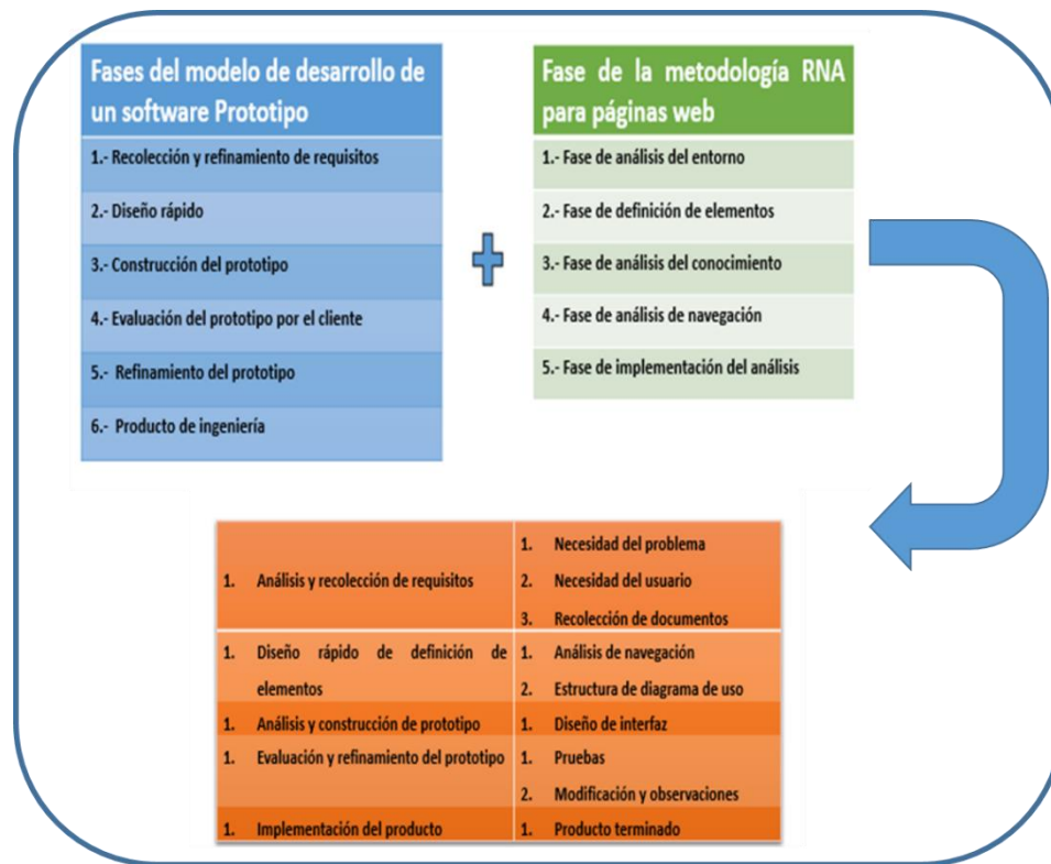
Figure 4. Phases Fusion Prototyping Methodology and Methodology Phases RNA.

Like result of methodological integration using RNA methodologies for web pages and model prototypes for software development, a merger in order to present a single methodology was obtained. (See Figure 3: Merger of prototypes).