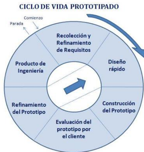
Figure 3. Phases Model Prototypes.

This model is basically trial and error. If the user does not like a part of the prototype means that the test failed, so should correct the error until you are satisfied. The prototype should be built in a short time through appropriate programs and not spend much money on it until it is approved, then you can start the real development of software. (See Figure 3).